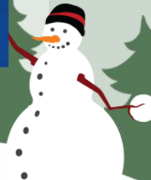
Fun in the snow...

In Reception we have been enjoying some Christmas craft activities. We have loved finger painting and creating our own plate baubles. We explored texture in the tuff tray using flour and fake snow.