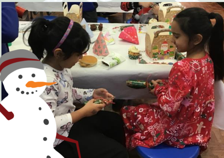
It's a cracker.