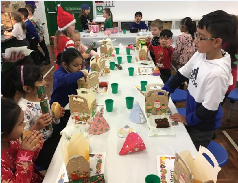
Best wishes for the New Year!

A big thank you to the kitchen staff for our fabulous Christmas dinner. We had delicious turkey baps and Christmas puddings. The dinner hall was decorated beautifully. Merry Christmas.