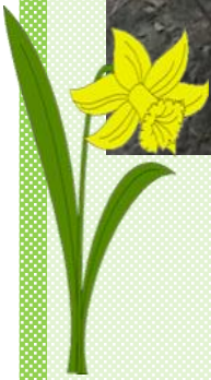
We have achieved the Bronze Award for all our hard work

Working with Trees for Cities, we have planted and created a hedgerow around the Edible Playground and Forest School Areas.